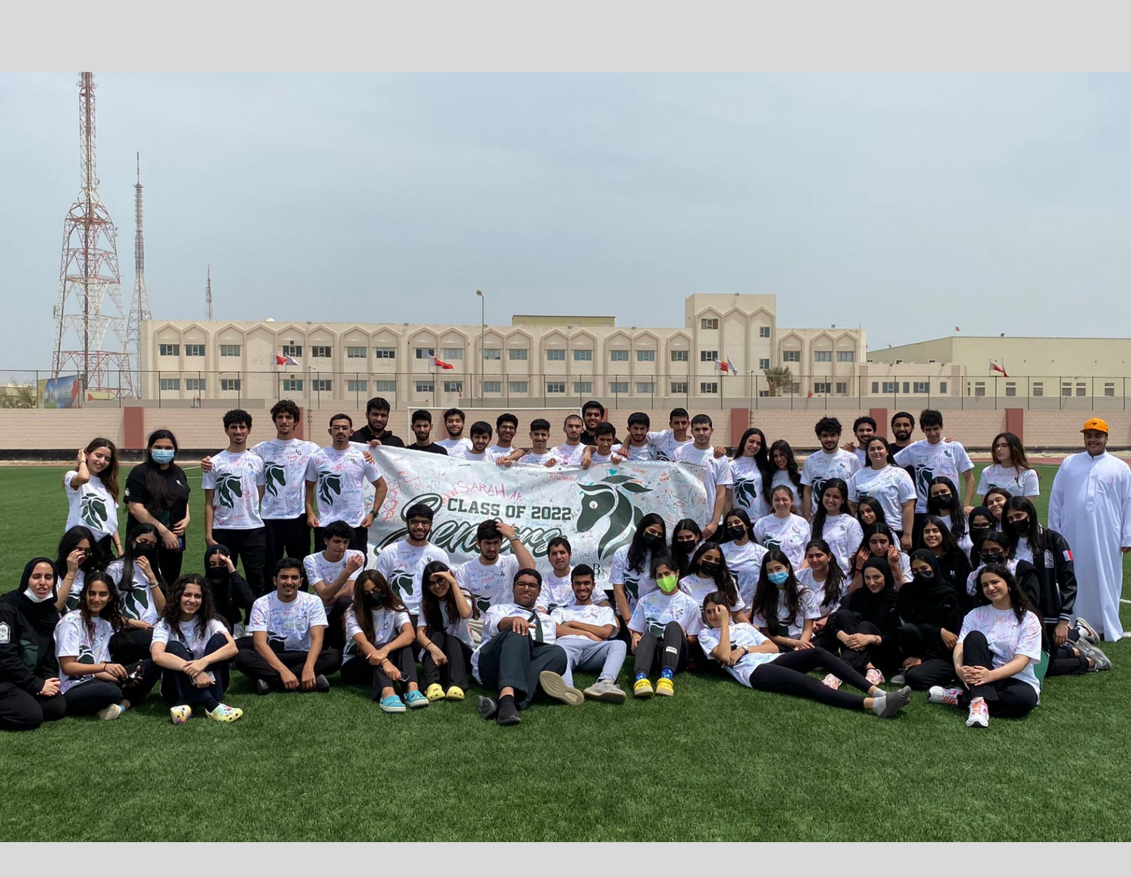
A SPECIAL FINAL ISSUE FOR 2022, A MESSAGE FROM OUR SENIORS

A NEWSLETTER WRITTEN BY BAYANIES, FOR BAYANIES